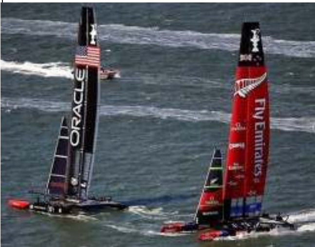
This years finalists

I was recently listening to the radio when a commentator began lamenting the pitiful performance of Oracle Team USA in the 34th America's Cup competition. He rambled on about the embarrassment of both failed technology and lackluster team performance that had allowed Emirates Team New Zealand to build up an 8 to 1 advantage. Obviously, the next day was only a formality in which Team USA would once again be trounced. Thus, I was really surprised on Wednesday when someone at the office started talking about the final race in the series and the unbelievable comeback of the American team. I had no idea! Oracle Team USA had reeled off seven straight wins to even up the match. Wednesday's event was the nineteenth and final race in this "first to win 9" competition. And to top it off, the Oracle team won on Wednesday in one of the most remarkable rallies in American sports history.