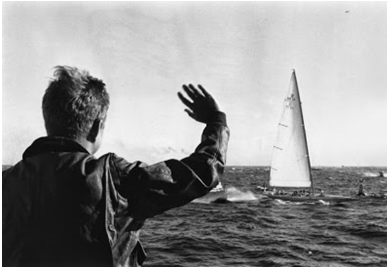
15 September 1962 President Kennedy waves to the America's Cup crew of the "Weatherly". Aboard the USS Joseph P. Kennedy, Jr., off Newport, Rhode Island.