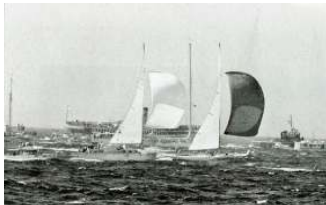
Gretel surfs through to windward of Weatherly in the 1962 America's Cup