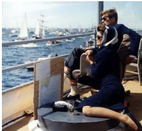
JFK and Jackie observe the race from the "veranda" aboard the USS Joseph P. Kennedy, Jr. (DD-850)