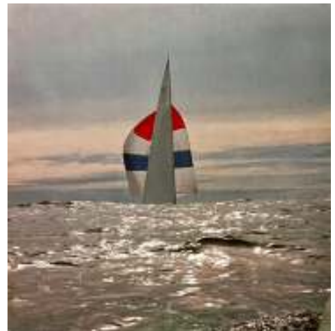
Nefertiti – One of the ships eliminated during trials

During these years, the race was a real gentleman's event. It took place off the coast of Newport, Rhode Island. Each morning, there was the ritual procession of vessels down the bay and past the old Brenton Reef lightship (about to be decommissioned, as the new Brenton Reef light tower was nearly finished and would soon be placed into service). This maritime entourage was made up of the escort ships (three navy destroyers and two Casco-class coast guard cutters), the judges' and officials' boats from the yacht club, the